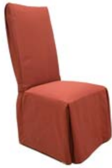
2 Corner pleats