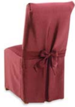
Back of chair