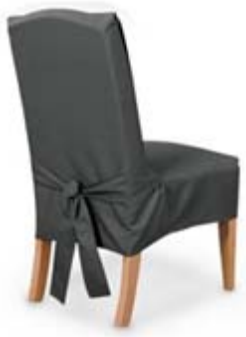
Skirt Height - Dim. "C1"